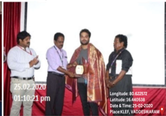
Participated Students are received certificates by chief Guest