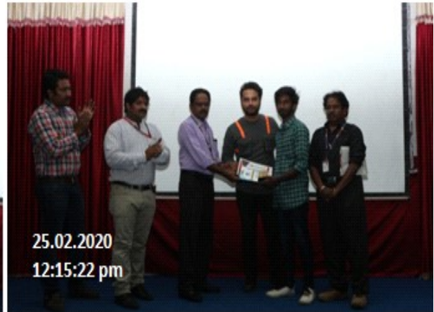
Participated Students are received certificates by chief Guest on 25.02.2020